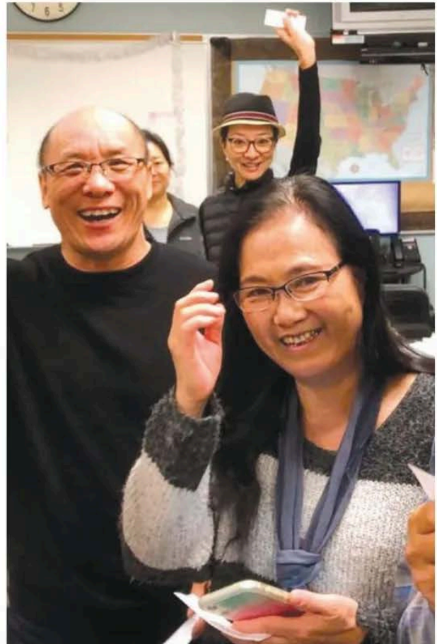
English as a Second Language continued on next page.

English Learner Civics is an important component of the MCAS ESL Program. We want our ESL students to understand why ESL Civics is included in our classes and why they should learn Civics content and do well on the Civics tests. The U.S. government believes that immigrants and other limited English proficient persons must not only master English, but be able to understand and navigate governmental, educational, workplace systems and key institutions, such as banking and health care in order to effectively participate in education, work, and civic opportunities in this country.